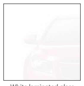
White laminated glass