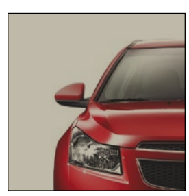
Bronze tinted glass