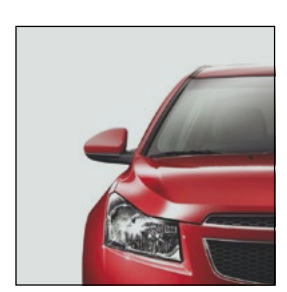
Gray tinted glass